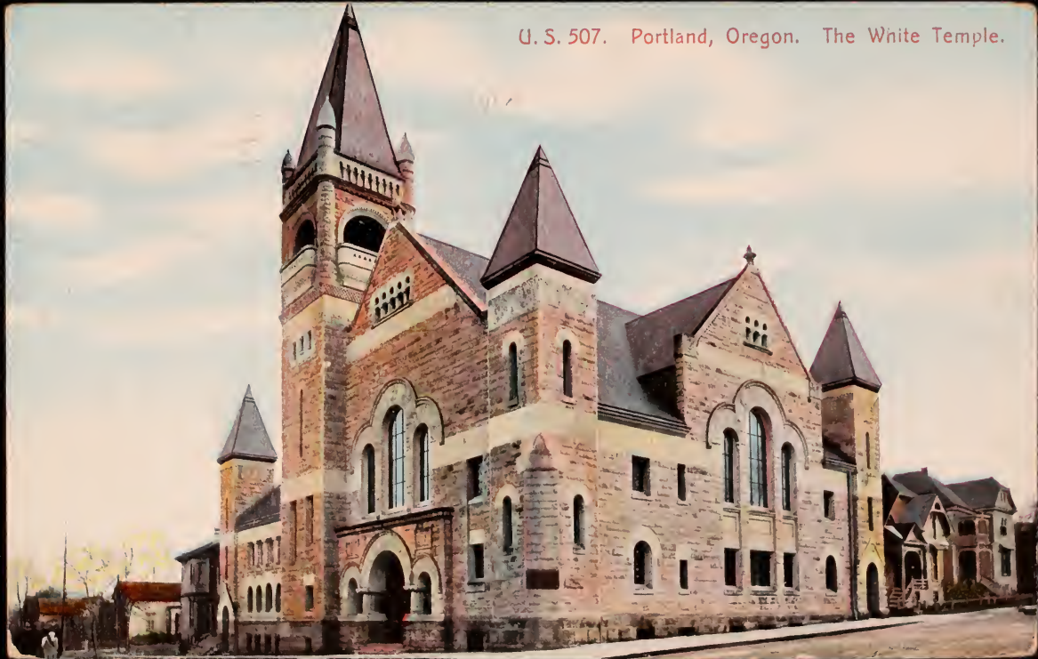
U. S. 507. Portland, Oregon. The White Temple.